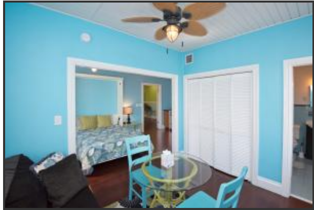
Room 3 a