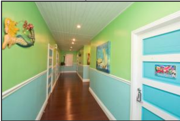
Hall entry to rooms2