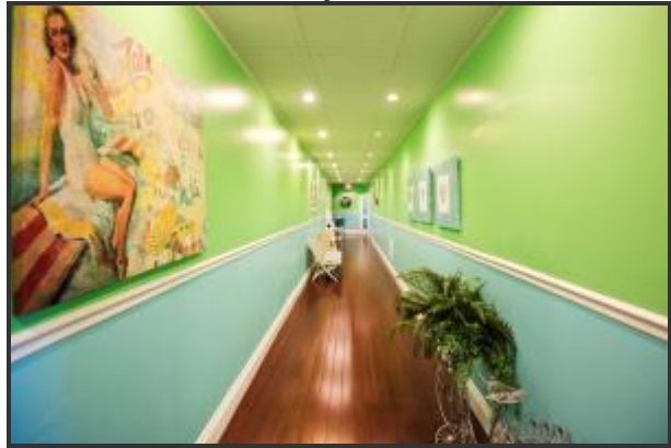
Hall entry to rooms