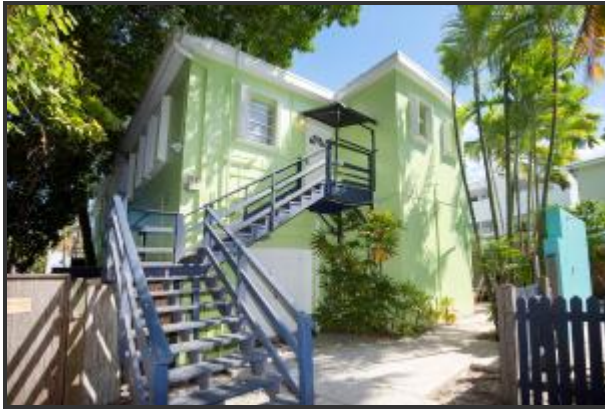
Rear entrance 2