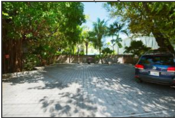
Off street parking